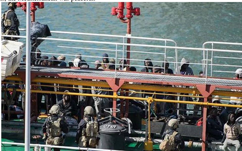
Fig. 1.Task Force Malta controlled migrants who took control of the ship that saved their lives

Any voluntary participation in the use of a vessel or aircraft when the participant knows from the facts that the ship or aircraft is a robber or aircraft sea;Any attempt to incite other persons to commit the acts identified under (a) or (b). The International Maritime Bureau (IMB) defines piracy as follows: "Act on any vessel with intent to commit theft or any other offense and with intent or ability to use force to perform such action. The history of piracy is closely linked to the history of the maritime industry. Pirates have also appeared since about 2000 BC. When the Phoenicians were dominating the Mediterranean area, a group of them became greedy, starting to split. to attack ships or even small towns in the coastal area to make a living. They are known as the first pirates In 500 BC, Greek pirates took the Lipari Islands (north of Sicily) as bases. On one occasion, the group attacked the convoys loaded with grain from the Romans into the Adriatic Sea in the Mediterranean region. As a consequence, they were punished by two Roman attacks, wiping out the bandits. Then, around 150 BC, piracy in the Cilicia coast of Turkey took control of the Mediterranean until 67 BC. When the Roman government then gave power to one of the most powerful generals, Pompey came to a standstill, and in just three months, the Mediterranean was peaceful.