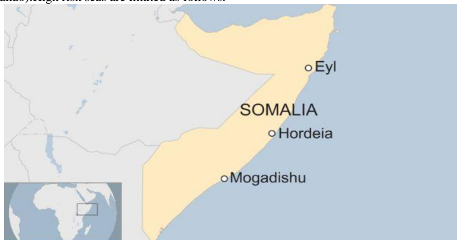
Figure 3.Somalia - prohibited and high risk area

• South America and the Caribbean: Brazil (Rio Grande); Haiti (Port au Prince); Jamaica (Kingston) and Peru (Callao).High risk seas are limited as follows: