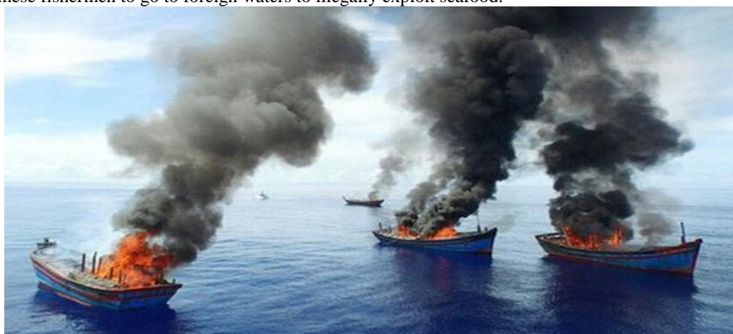
Figure 2. Fishing vessels of Vietnamese fishermen captured and burned by the island nation of Palau in June 2015

Besides that, a number of legal regulations to manage and supervise the operation of fishing vessels on the sea are incomprehensive and not strict. The implementation of measures by the government where direct management of fishermen and fishing vessels has not been drastic. Especially, there are now a number of organizations and lines in both foreign and domestic performing brokerage activities, mobilizing and organizing Vietnamese fishermen to go to foreign waters to illegally exploit seafood.