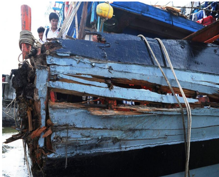
Figure 3. Vietnamese fishing vessel stabbed by foreign ships

Most recently, a fishing boat of Quang Nam fishermen in Vietnam while catching in the traditional fishing ground was besieged by Chinese ships, carrying weapons to climb aboard and robbing seafood. To avoid robbery peeling off occurs on the sea, fishermen when exploiting aquatic products need to organize according to the model of production teams and teams at sea. Do not go to the waters of the countries to illegally exploit. When fishing in waters adjacent to foreign waters, it is necessary to keep a safe distance, avoid the case due to the influence of the ocean currents, bad weather makes the boat drift to the waters of other countries. In the course of exploiting and operating on the sea, if an incident occurs, it is necessary to immediately notify the nearby ships and notify the functional agencies for timely plans on rescue and support. Fishermen need to learn about Vietnamese and international Law of the Sea to understand and avoid violations when exploiting.