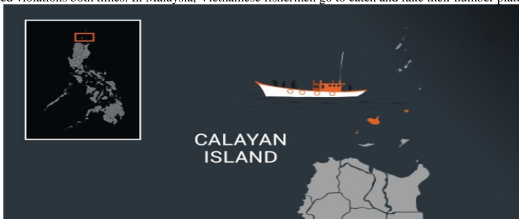
Figure 1. The location where Vietnamese fishing vessels were arrested by the Philippines in June 2019