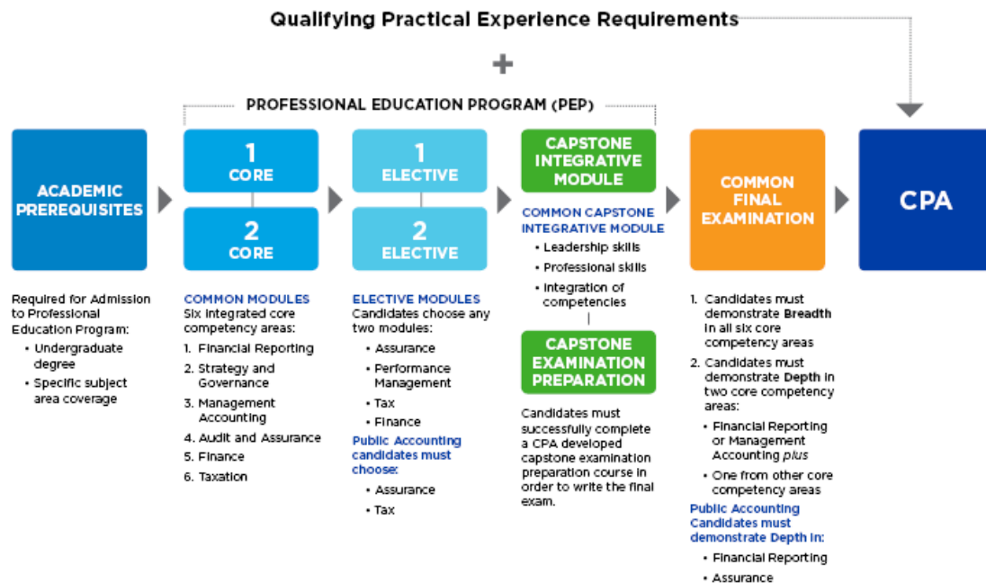
Figure 1. The education system in UK[1]