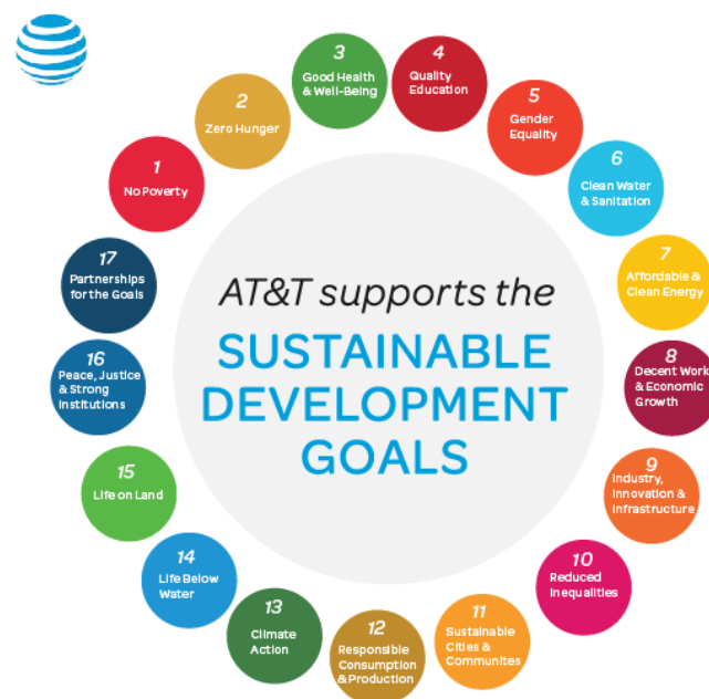
Fig. 2.Sustainable Development

According to the World Tourism Organization (WTO): "Sustainable tourism development is the development of tourism activities to meet the current needs of tourists and indigenous people, while still interested in preserving and embellishing resources for future tourism development"[10]. Sustainable tourism development is the most complete and comfortable meeting the needs of tourists, attracting tourists to regions and tourist spots today and protecting and improving the quality for the future.