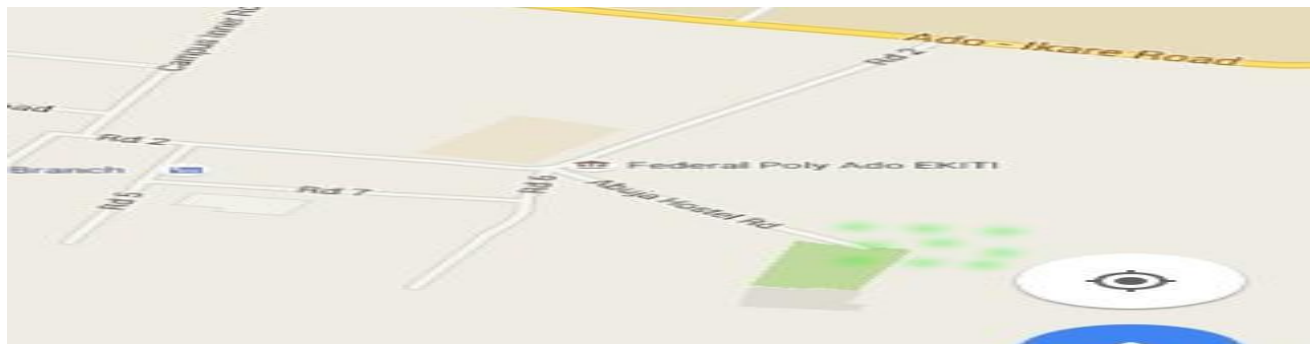
Fig 1: Geographical location of the soil environment