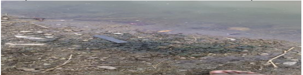
Plate. 1: The image of “SAMPLE C” completely immersed in soil environment

Where W is the weight loss in milligrams, D is the density in \text{g/cm}^3 , A is the area in \text{cm}^2 , and T is the time of exposure in hours. Curves of corrosion rate (calculated) versus time of immersion were also plotted.