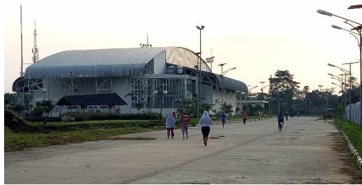
Figure 6. Activity in Arcamanik Sport Center, 2017

Photo above shows the number of people who are jogging in Arcamanik Sport Center area. In addition, there are other activities such as bicycling or doing gymnastics and zumba exercise. Sport activities in Arcamanik Sport Center is not just jogging, but a lot of sports that have been provided to support community activities in sports.