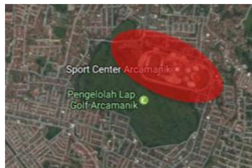
Figure 2. The Scope of the Study Area

Research method in the study used descriptive by describing the reality that occurred during the survey research conducted from March 2017 to January 2018. In addition, the method in this study is part of quantitative method.