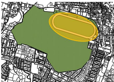
Figure 3 Scope Study Area

The research method used is defamiliarization. It is an attempt to find new understanding through the process of identifying, decomposing and recomposing. The defamiliarization method works by selecting regional elements that have the potential to act as 'place - defining elements' (Source: Mark Nesbitt, 1995).