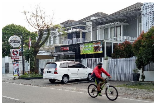
Figure 7. Bicycling Activity in Arcamanik Sport Center, 2017

Photo above shows the number of people who are jogging in Arcamanik Sport Center area. In addition, there are other activities such as bicycling or doing gymnastics and zumba exercise. Sport activities in Arcamanik Sport Center is not just jogging, but a lot of sports that have been provided to support community activities in sports.