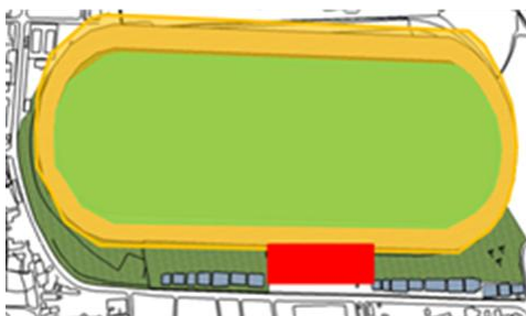
Figure 4. Zoning of Function Analysis at Arcamanik Sport Center Transformation in 1999-2015

Arcamanik Sport Center in 1999 had a change or transformation to a new zoning of functions and form, which arose with cause-and-effect from Arcamanik Sport Center activities. Since 2000 until 2009, activities at the horse races were very high, both for regional and provincial competition. High activity of the house racing track causes the emergence of new facility need that is tribune for spectators with the purpose to enjoy the race horse and protect from heat or rain. Meanwhile, at golf course, high activity will cause need of equipment for golf. This led to the emergence of illegal kiosks or unlicensed by the government to be the emergence of new problems due to no permit permanent construction of Arcamanik golf course grounds.